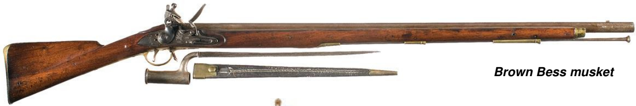
Brown Bess musket

The Museum Collection is very rich in weapons from 1850's onward but there are significant gaps in our earlier holdings; for example we do not have either a Long Land or Short Land pattern Musket (the famous "Brown Bess") with which the regiment was equipped throughout the campaigns of the 18 th century, including the American War of Independence, or indeed a 1796 pattern Officer's spadron which was carried throughout the Napoleonic Wars. We are actively seeking to fill these gaps and good examples are available from reputable dealers from time to time! Any offers of assistance will be gratefully received.