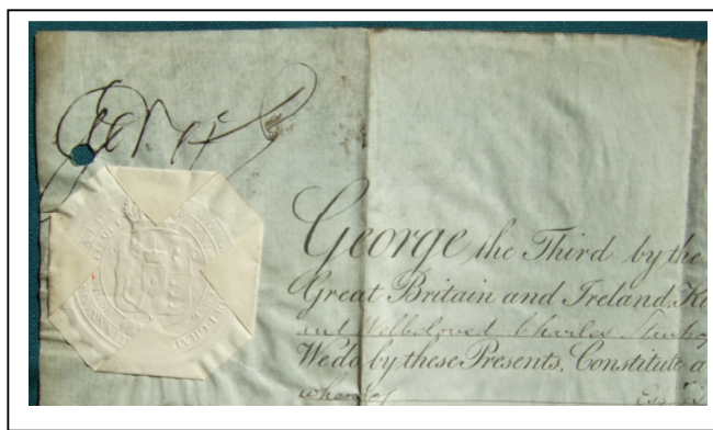
and in 1808

These original Commission documents have now all been collected together and individually protected in acid-free transparent polyester envelopes. They have been indexed and arranged in chronological order in an acid-free card Solander box and may readily be consulted by researchers.