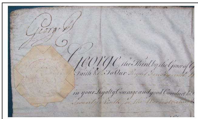
Signature of King George III in 1792