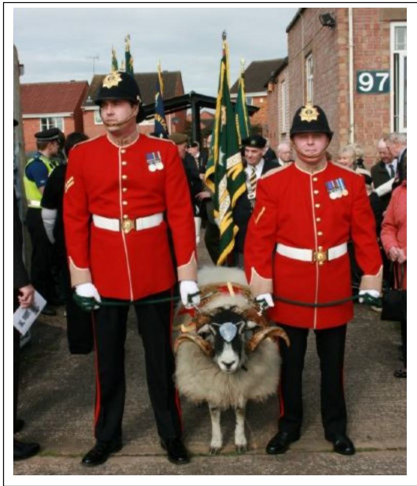
Corporal ..... and Lance Corporal ..... with the regimental mascot .....