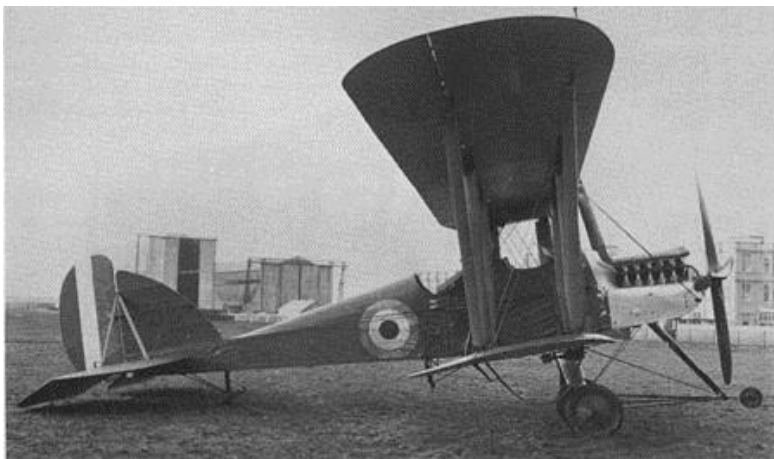
RAF 4a powered R.E.7