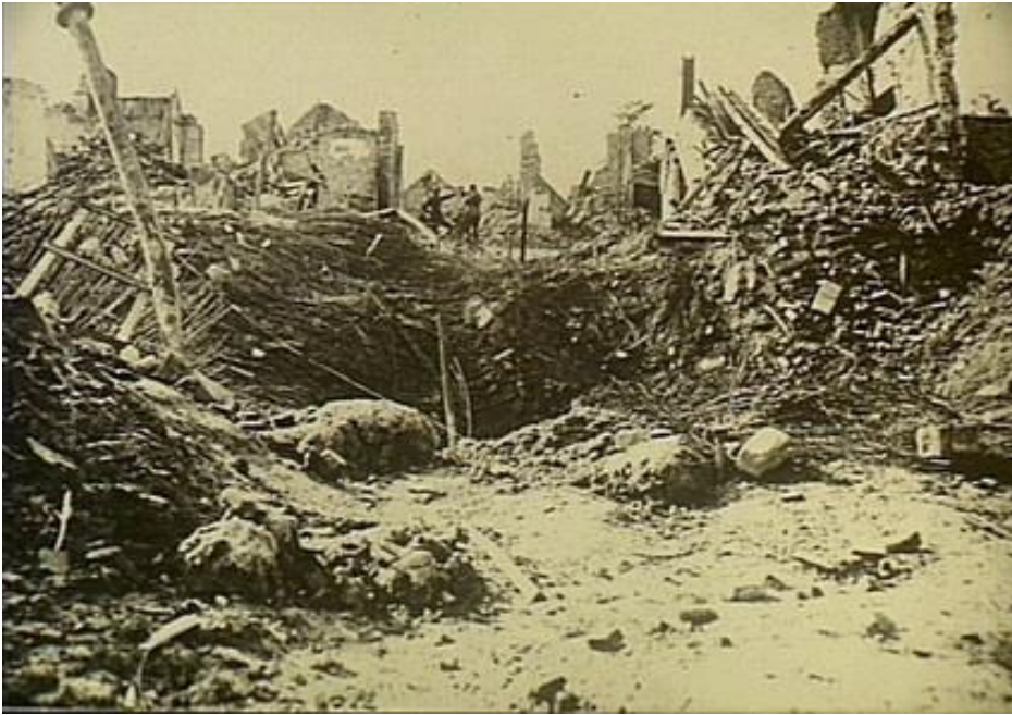
The ruins of Neuve Eglise after capture.

Leaving the Mairie accompanied by 10 volunteers on what appeared to be close to a suicide mission, his party now advanced by short rushes to a position where it was able to engage the machine guns with rifle fire. It was however clear that a frontal assault from there was unlikely to succeed, so he worked his way around to the rear of the enemy positions with two