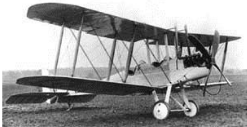
Royal Aircraft Factory B.E.2c

In all nearly 300 Officers and men of the Worcestershire Regiment served with the RFC and the RAF. Through those men that had served in both services, the Worcestershire Regiment and the Royal Air Force have enjoyed a close relationship and as the RAF reaches and celebrates its Centenary, the regiment can be justifiably proud of the part it has played and the significant contribution made to its success.