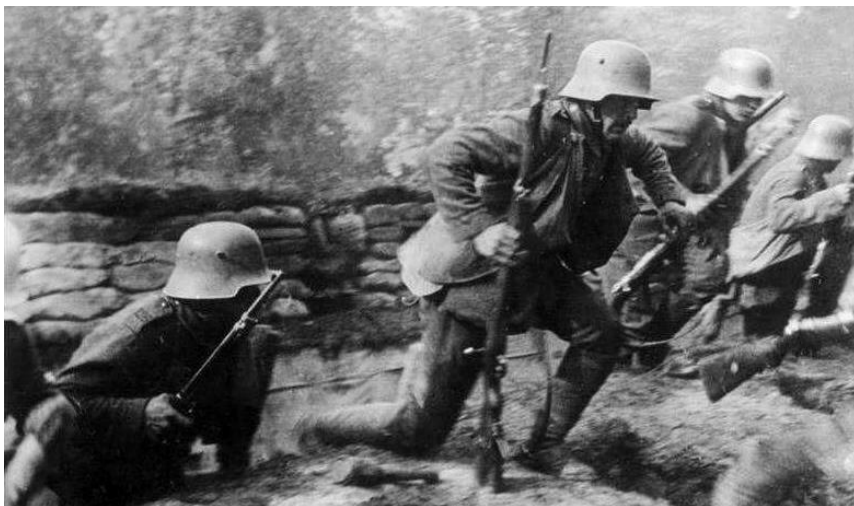
German 'Stormtroopers' on the move during operations on the Western Front, 1918.