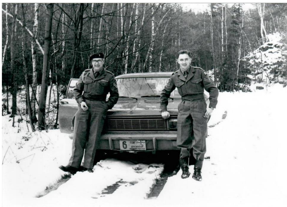
A RASC driver and NCO on tour.

An Army tour team normally consisted of an officer, NCO and Cpl driver, all unarmed and without a radio. Their task was to observe Soviet and East German ground exercises and their equipment, and to watch for any signs of large-scale movement near the border which might indicate an invasion of Western Europe. Tours usually lasted 2-3 days, including staying out overnight. They had general freedom of movement except