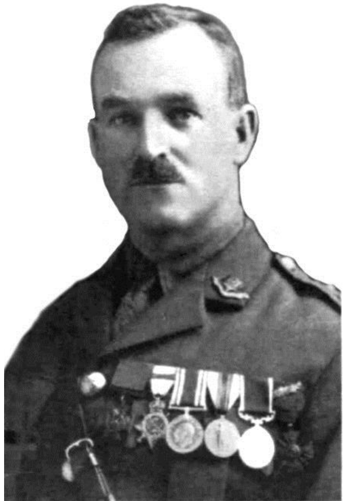
Lieutenant John James Crowe V.C.

By nightfall on that day the front line had been penetrated, with the Worcestershire companies driven back and fighting separate isolated defensive actions. The battalion HQ in the village, reinforced by two infantry platoons, was now in the front line, and its defence of the Mairie became the subject of a fierce and sustained fire fight, the Germans surrounding the position and employing machine guns and trench mortars. By mid-morning on the 14 th it was clear that the defence could not be sustained indefinitely. Withdrawal however looked impossible; the route out was dominated by German machine guns with supporting troops behind the position, and a messenger who had tried to take out a message had already been killed. At this point Crowe, who had already shown great bravery in the defence, volunteered to lead a sortie into the same fire-swept terrain, to clear the way.