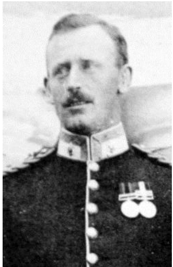
Lt. Col. Charles Strangeways Linton DSO MC. Whilst commanding the 4th Battalion at Cambrai fell in action on November 20th 1917.

The battalion was relieved late in the afternoon. The day’s casualties amounted to 8 officers and 167 men of whom 40 were posted missing. After receiving reinforcements, rest and training the battalion was next in action at the battle of Cambrai in mid-November.